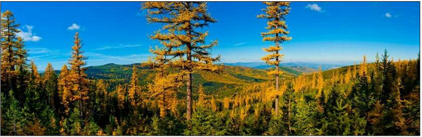
The Skyliners posted a photo on their facebook page from their Oct. 20th trail ride with the Big Sky 4-Wheelers of the Tamarack trees at peak color on Blacktail.